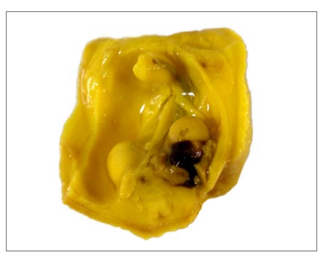
Figure 3. Haemorrhagic saturation of adrenal and retroperitoneal hematoma (C,)

In the group of animals whose mothers received caffeine at 10 °C or 45 °C subcutaneous haematomas were observed significantly more frequently in the sublingual region, and saturation haemorrhaging in the lungs. Pericardial and retroperitoneal haematoma and saturation haemorrhaging of the adrenal glands occurred more frequently in all foetal groups whose mothers were given caffeine (Tab. 1).