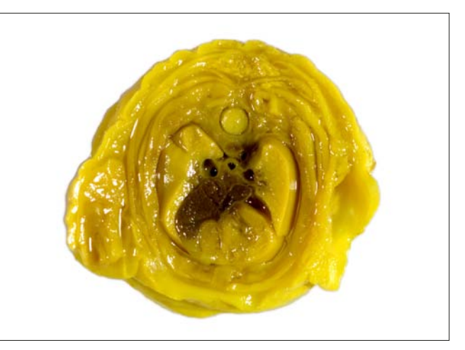
Figure 2. Incorrect position of liver in the mediastinum back - diaphragmatic hernia (group {\rm E_3})

An examination of the internal organs revealed the presence of individual diaphragmatic hernias in foetuses from both the mothers receiving caffeine at 10 °C as well as 45 °C (Fig. 2, Tab. 1). Furthermore, developmental abnormalities were observed in the form of haematomas or saturated bleeding in the internal organs (Fig. 3, Tab. 1). Subcutaneous haemorrhages were located mostly in the interscapular region, and less frequently around the eyelids and nostril, and on the extensor surface of the paws.